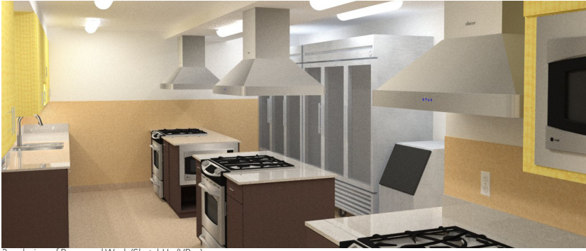
Rendering of Proposed Work (SketchUp/VRay)

Location: Washington, DC Use: Multi-Family Concept: Warm Remodel Year: 2013